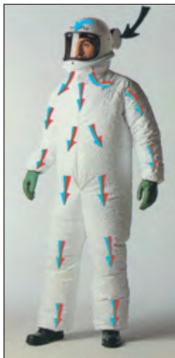
PRESSURIZED TYVEC SUIT