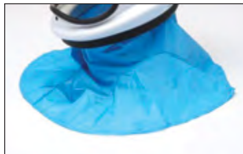
SHOULDER LENGTH VENTED COLLAR