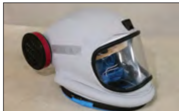
REMOVABLE CLOTH HELMET LINER FOR OUTER SHELL PROTECTION