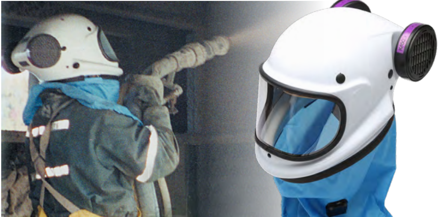
Model: Kompat 88

SHOTCRETE HELMET delivers full “NIOSH Approved” respiratory protection and conforms to “ANSI and European Standards” for head and eye protection, giving you full mobility, safety and comfort. Complete with built-in rechargeable battery powered fans and replaceable filters.