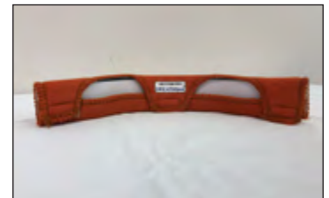
REPLACEABLE SWEATSO PAD FOR INNER HEAD SUPPORT