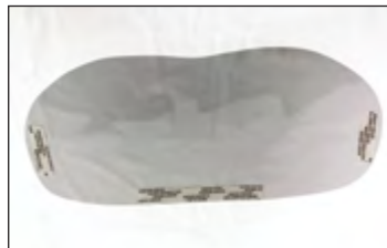
TEAR OFF VISOR