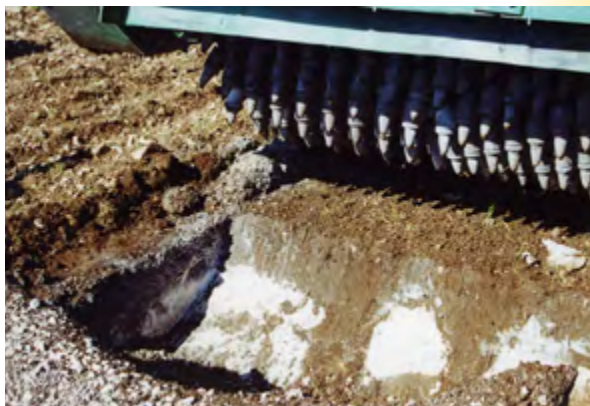
Tungsten Carbide 'BlonXX ™ ' pics arranged in a unique spiral pattern for maximum crushing efficiency.