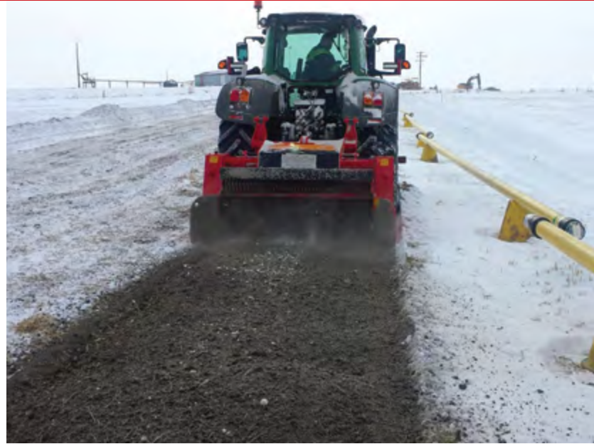
Roto Crusher grinding off frozen layer of soil to prepare for trenching and laying of pipe.