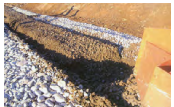
Slower rotor speed for rocks and soil.