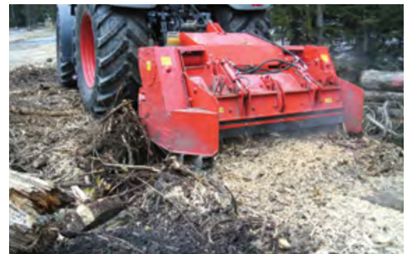
Faster rotor speed for stumps and wood.