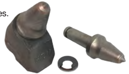
Blonxx™ tungsten carbide pics.

Blonxx pics are the most economical type of wear parts for rock crushers at present.