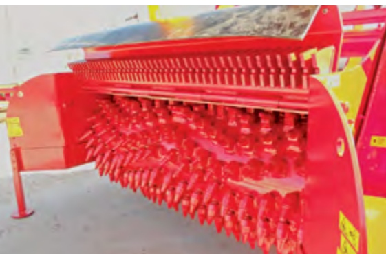
Adjustable grate made of HARDOX® steel is built in to the underside of rear door. Allows operator to determine the size of the finished product.