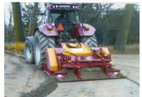
Rejuvenate dirt and gravel roads at a fraction of the cost.