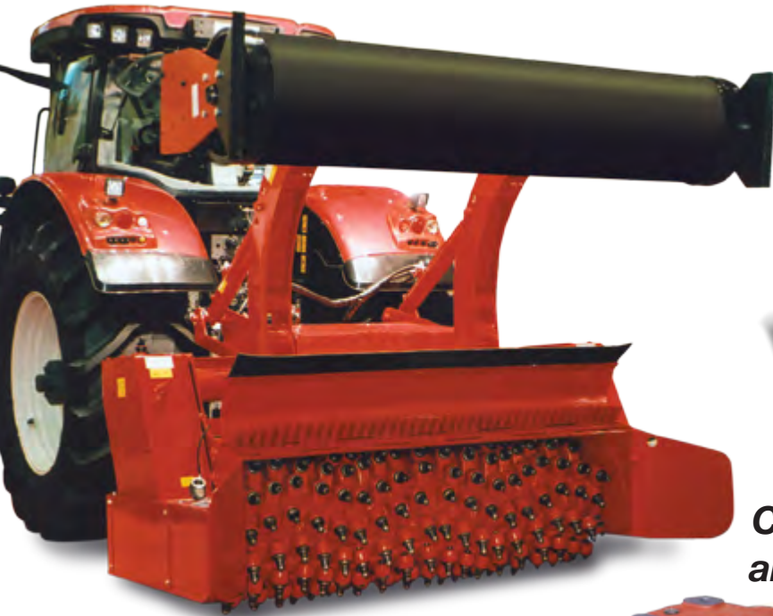
Shown with optional compacting roller.

Combination - Stone Crusher, Wood Mulcher and Deep Tiller.