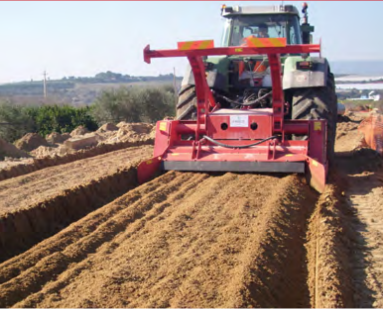
Maximize farmland by reclaiming rocky, overgrown and previously unusable areas.